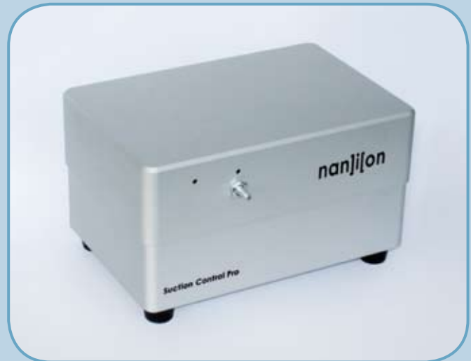
The Suction Control Pro offers improved performance, new experimental possibilities and is compatible with earlier versions of the Port-a-Patch® platform.

Suction Control Pro is available when purchasing a Port-a-Patch® system and is also compatible with existing Port-a-Patch® systems. Contact us if you are interested in upgrading to Suction Control Pro!